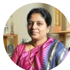
Tessy Thomas Former Director General DRDO